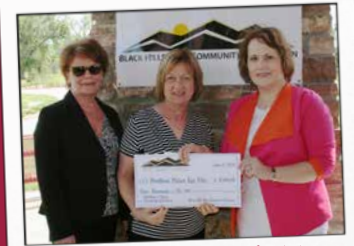
Black Hills Area Community Foundation presents grant award check to NPEF