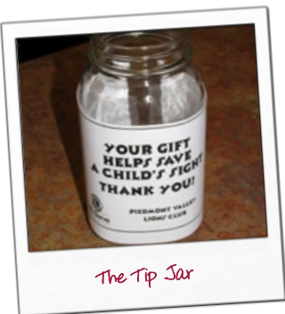
The Tip Jar

Pizza anyone? Thankfully, the answer was, "Yes," when Piedmont Valley Lions Club , a Northern Plains Eye Foundation Western South Dakota Lions Children's Vision Screening Initiative (CVSI) partner, hosted a benefit fundraiser at Rapid City's Pizza Ranch!