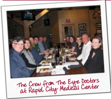
The Crew From The Eye Doctors at Rapid City Medical Center

Northern Plains Eye Foundation (NPEF) extends a heart-felt thank you to The Rotary Club of Rapid City and Murphy's Pub & Grill for hosting a wonderful evening filled with great friends, delicious fare and fundraising to support children's vision screening efforts. Thanks, as well, to all of the folks – almost one hundred of them – who braved a chilly evening in January in support of this event!