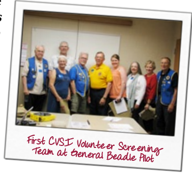
First CVSI Volunteer Screening Team at General Beadle Pilot