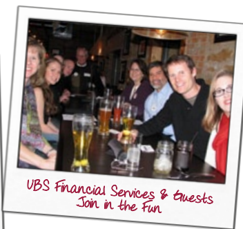
UBS Financial Services & guests Join in the Fun