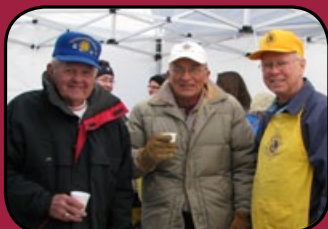
Hot Coffee and Cool Lions