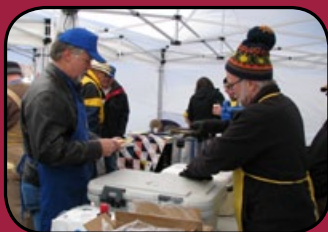
Servin' it Up, Lions Style