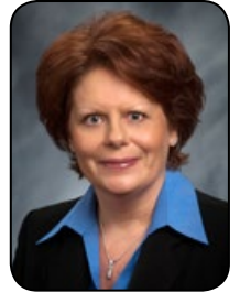
Executive Director Northern Plains Eye Foundation

As we say goodbye to 2013, on behalf of the Board of Directors and staff of Northern Plains Eye Foundation, may your holidays be bright and your New Year be filled with health, happiness and prosperity.