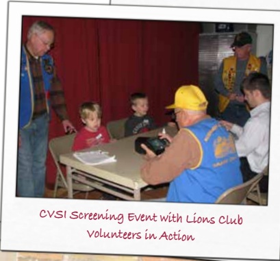
CVSI Screening Event with Lions Club Volunteers in Action