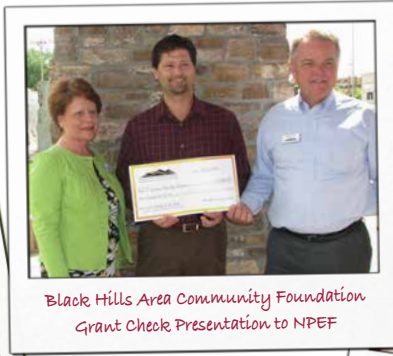
Black Hills Area Community Foundation Grant Check Presentation to NPEF