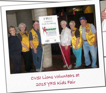
CVSI Lions Volunteers at 2015 YFS Kids Fair